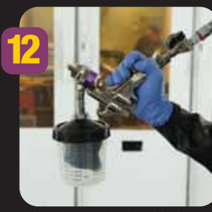
Air only needs to be bled if spraying is to be in the inverted position.