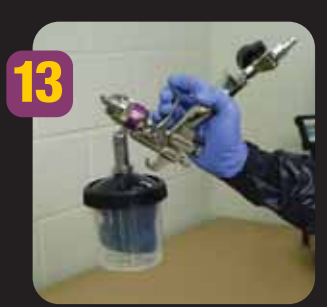
Disconnect air line, invert gun and pull trigger (full open, not partial) to return mix to gun cup before disconnecting gun.