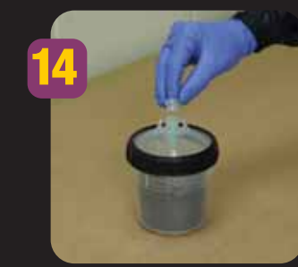
Consult paint or solvent Material Safety Data Sheet (MSDS) for safe use and disposal