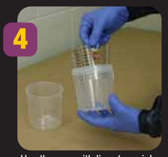
Use the cup with liner to weigh the paint according to paint manufacturer's guidelines or insert 3M™ Mix Ratio Film into the cup before placing liner into cup.