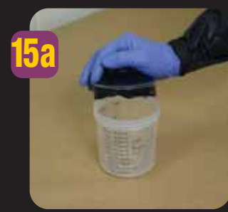
When you are done using the system, the lid and liner can easily be removed.