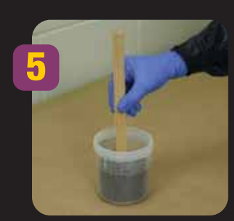
Mix product as needed.