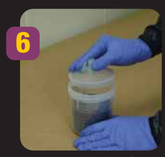
Take a lid (with built-in filter) from wall dispenser and snap onto top of 3M<sup>TM</sup> PPS<sup>TM</sup> cup/liner.