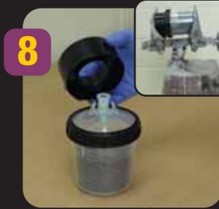
3M<sup>™</sup> PPS<sup>™</sup> cup shaker core is used to distribute clamping force when shaker machines are used to mix.