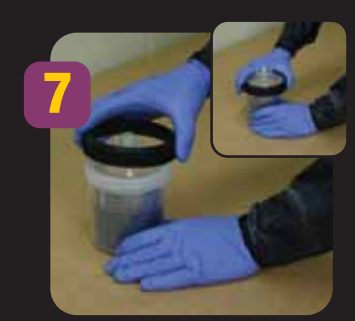
Position locking collar onto the 3M<sup>™</sup> PPS<sup>™</sup> cup/liner and turn until tight.