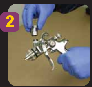
Thread correct adapter into spray gun.