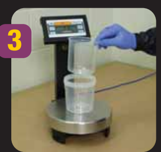
Remove liner from wall dispenser and place in 3MTM PPS™ mixing cup.