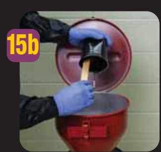
Remove unused material from the liner and place into proper disposal. Consult local regulations or authorities for proper